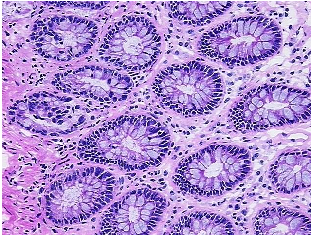
DNA - 20x.