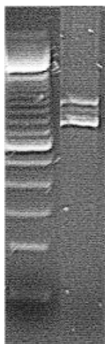
DNA PCR Image