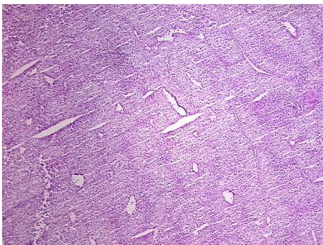
DNA - 4x.