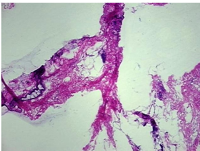
DNA - 4x.