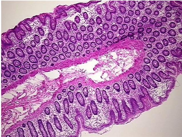
DNA - 4x.