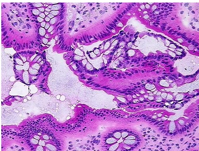
DNA - 20x.