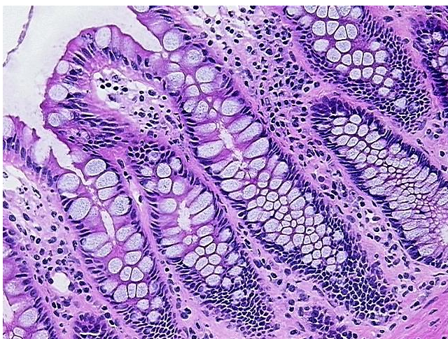
DNA - 20x.