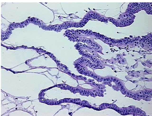
DNA - 20x.