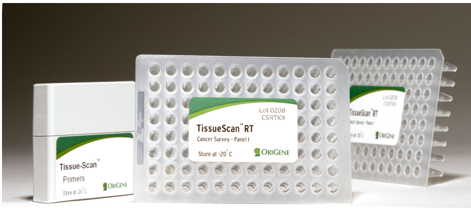
TissueScan product image.