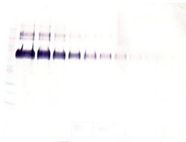
Western Blot (Reduced) using Klotho antibody Cat.-NoAP32851PU