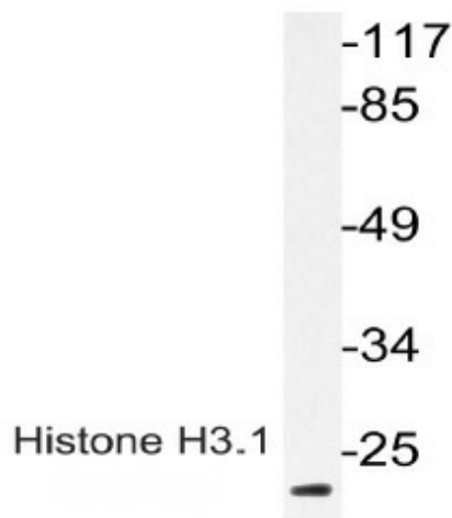
Western blot (WB) analysis of p-Histone H3.1 antibody (Cat.-No.: AP20892PU-N) in extracts from HuvEc Serum cells