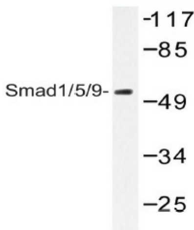
Western blot (WB) analysis of Smad1/5/9 antibody (Cat.-No.: [AP20533PU-N]) in extracts from HeLa cells.