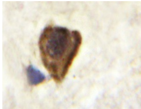
Immunohistochemistry analyzes of PDGFR- \beta antibody ([AP20314PU-NJ]) in paraffin-embedded human brain tissue.