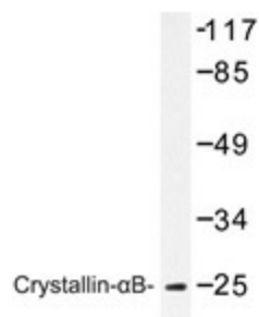
Western blot analysis of Crystallin-αB antibody (AP20218PU-N) in extracts from mouse lung cells.