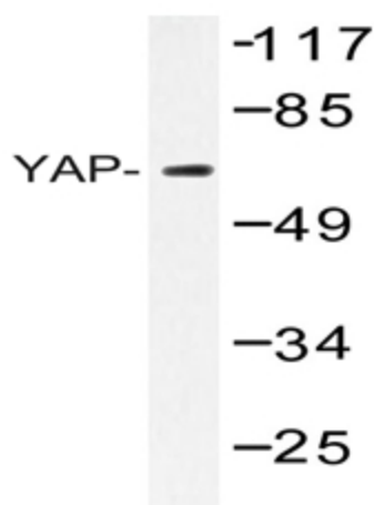
Western blot analysis of YAP Antibody in extracts from HeLa cells.