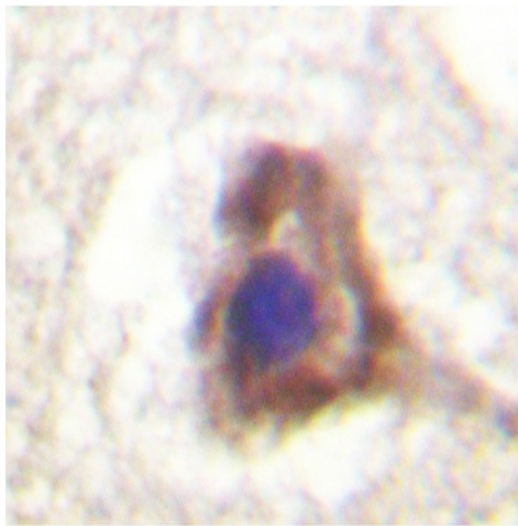
Immunohistochemistry analysis of PECAM-1/CD31 antibody in paraffin-embedded human brain tissue.