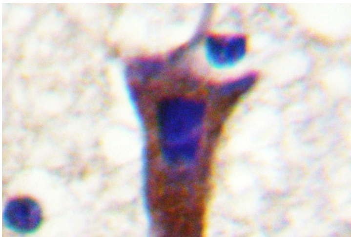
Immunohistochemistry (IHC) analysis of mTOR antibody in paraffin-embedded human brain tissue.