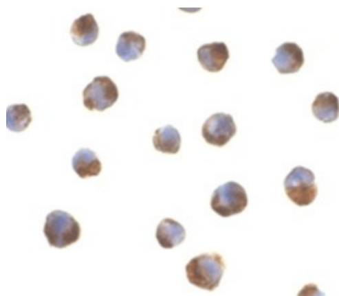
Immunocytochemical staining of P815 mouse mastocytoma cells with Rabbit anti Human caspase-5