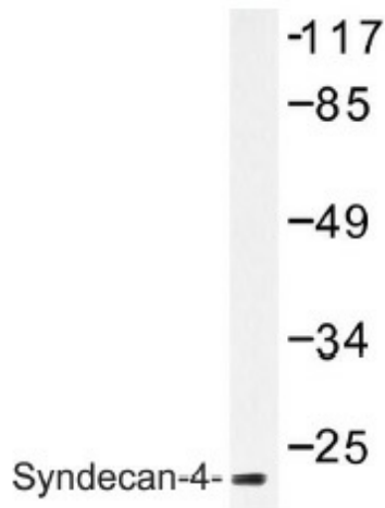
Western blot (WB) analysis of Syndecan-4 antibody in extracts from HepG2 cells.