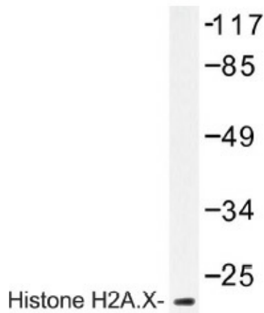
Western blot (WB) analysis of Histone H2A.X antibody (Cat.-No.: [AP01346PU-N]) in extracts from HT29 cells.