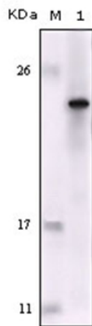
Western blot analysis using FES antibody Cat.-No AM06182SU-N against truncated FES recombinant protein.