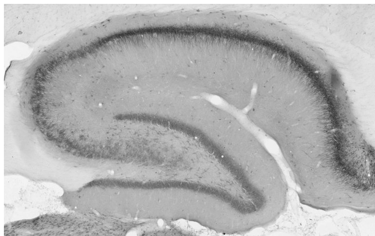
Adult rat hippocampus immunohistochemistry