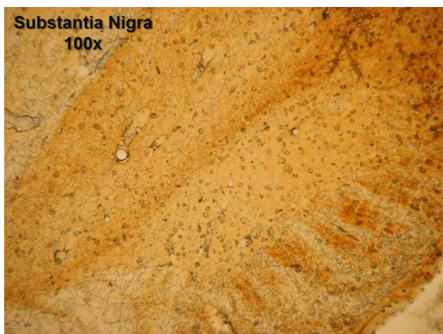
Staining with Substance P antibody